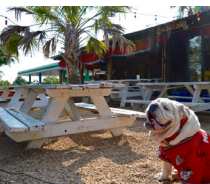
CALI N TITO'S

And just remember, there are four strategically placed Chick-fil-As in Athens for a reason.