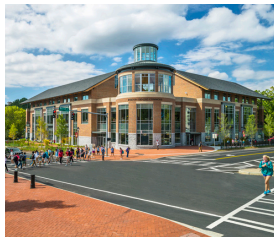
BOLTON DINING HALL

The start of something new – Don't take UGA/classes as seriously as they take themselves. Freshman year is about more than grades. You're laying the foundation of your social and spiritual life for the next four years, which is exciting stuff!