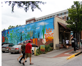
LAST RESORT GRILL

Honorable mentions – UGA Creamery, DePalma's Italian Cafe, Alumni Cookie Dough, Condor Chocolates, The Grit, Ike & Jane