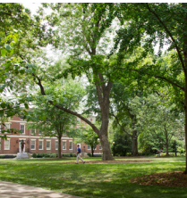
NORTH CAMPUS LAWN

Off Campus – Botanical Gardens (indoor and outdoor seating), Athens-Clarke County Library, Carnegie Library on Health Sciences Campus, the basement of Walker's (downtown).